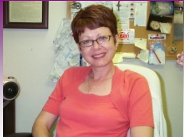
Peppi states that people with disabilities have been re-entering the workforce in greater numbers in the last 20 years.

Peppi cites the example of a young woman with developmental disabilities whom she knows personally. This woman went to work 25 hours per week at a grocery store sacking groceries, stocking the shelves and running errands for other employees. Reportedly this person enjoyed a more fulfilling life than she had had before going to work.