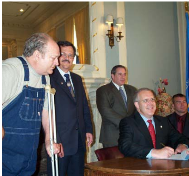
Governor Brad Henry signed House Bill 1524 which made it illegal to kill a service animal in the state of Oklahoma

Social Security income. Under duress, I found my monkey a home outside Oklahoma City where I knew it would be safe and could help another person with disabilities."