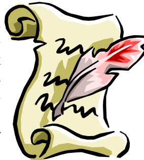
Americans with Disabilities Act (ADA) signed by President George Bush July 26, 1990

with disability as the Civil Rights Act of 1964 has for persons of color. Both are federal legislation granting civil rights to minority groups in the United States. Both acknowledge that major minority groups in this county have equal rights under our federal Constitution—equal rights with the American majority. We are all to be treated equally and fairly.